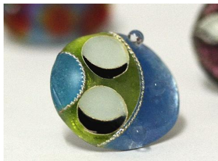
Example of use (HBF-01-SS)